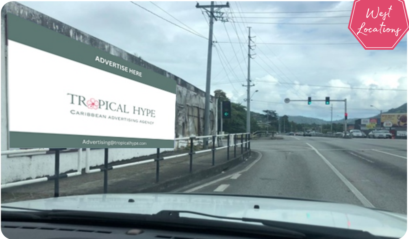
North & Westbound